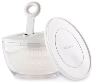
Salad & Berry Spinner with Lid (Retail Value $68.50)

The first raffle is the “Spin, Cut, & Take Bundle” and it includes: