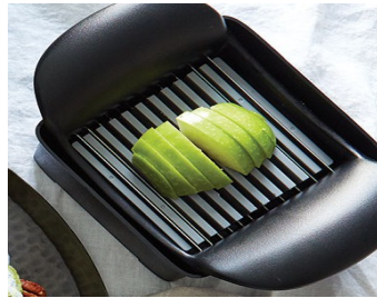
Quick Slice (Retail Value $34.00)