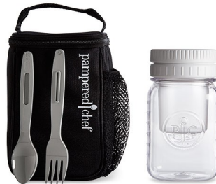
Make & Take Mason Jar Set (Retail Value $27.50)